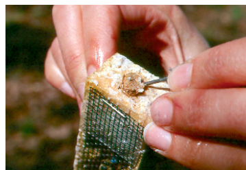
Figure 7. Gently remove the cork on the candy end of the queen cage.

Step 8. Next, remove the wood panel and quickly invert the package over the hive body. Firmly and vigorously shake the bees into the space in the hive (Figure 4). It might be necessary to shake the package several times. Don't worry if there are a large number of bees flying around; they are largely "confused" and therefore not defensive, and they will eventually settle down and enter the hive.