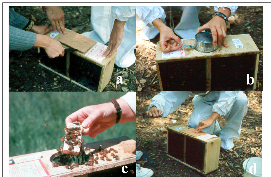
Figure 3. (a) Remove the package lid. (b) Remove the feeder and queen cage. (c) Check that the queen is alive in her cage. (d) Quickly replace the package lid.

Step 7. Immediately before installing the bees into the hive, firmly knock the package on the ground once to make the bees drop to the bottom of the box. Be sure to hold the wooden lid in place while doing this.