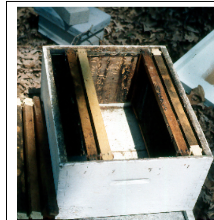
Figure 2. Prepare a space in the hive in which to shake the bees.

Step 4. Remove three or four frames from the center of the brood chamber to create a space in the hive for the bees (Figure 2).