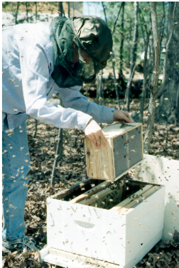
Figure 4. Shake the bees into the hive.