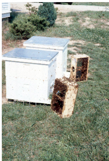
Figure 5. Let the remaining bees enter the hive.