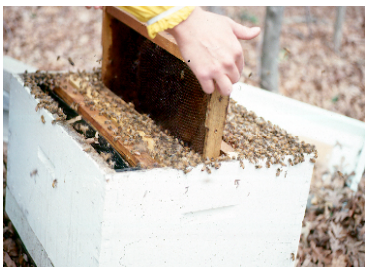
Figure 6. Replace the frames.