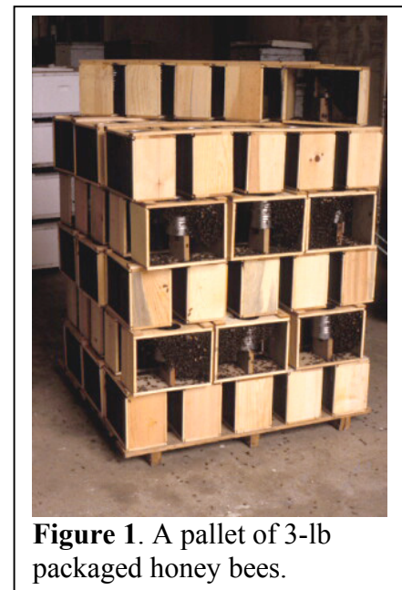
Figure 1. A pallet of 3-lb packaged honey bees.

Step 2. Place the package in a cool, dark place to allow the bees to ‘rest’ for several hours before installing them into a hive. Make sure the bees are not exposed to excessive heat or cold, loud noise, or