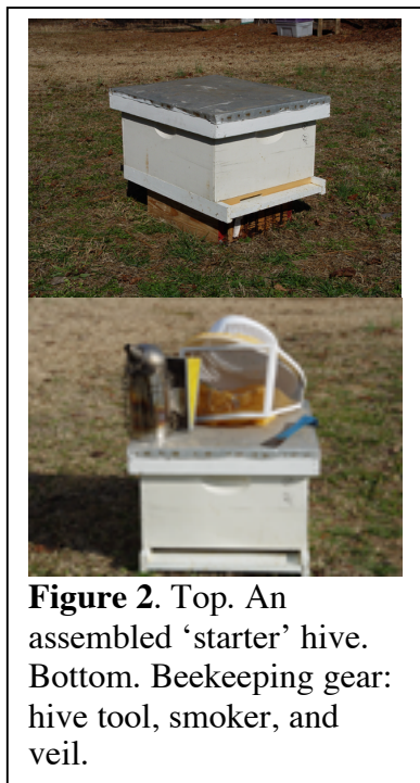
Figure 2. Top. An assembled ‘starter’ hive. Bottom. Beekeeping gear: hive tool, smoker, and veil.

We recommend that a first-time beekeeper start with two full beehives. That way, you will have a minimal frame of reference to compare your new colonies and to develop your management techniques.