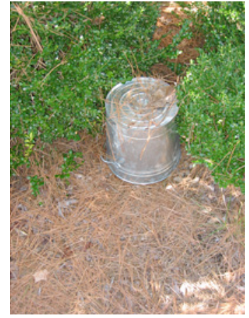
Figure 3. Inverted pails or flower pots should be removed to eliminate potential nesting sites for bees.